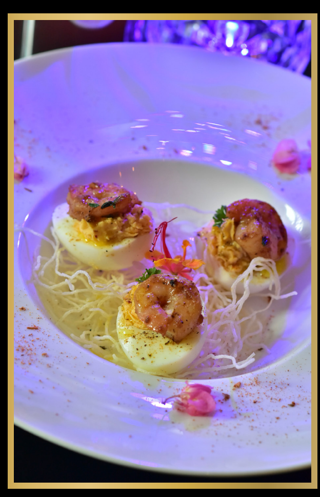
DEVILLED CAJUN EGGS CLASSIC DISH OF EGGS AND SPICES TOPPED WITH SHRIMP