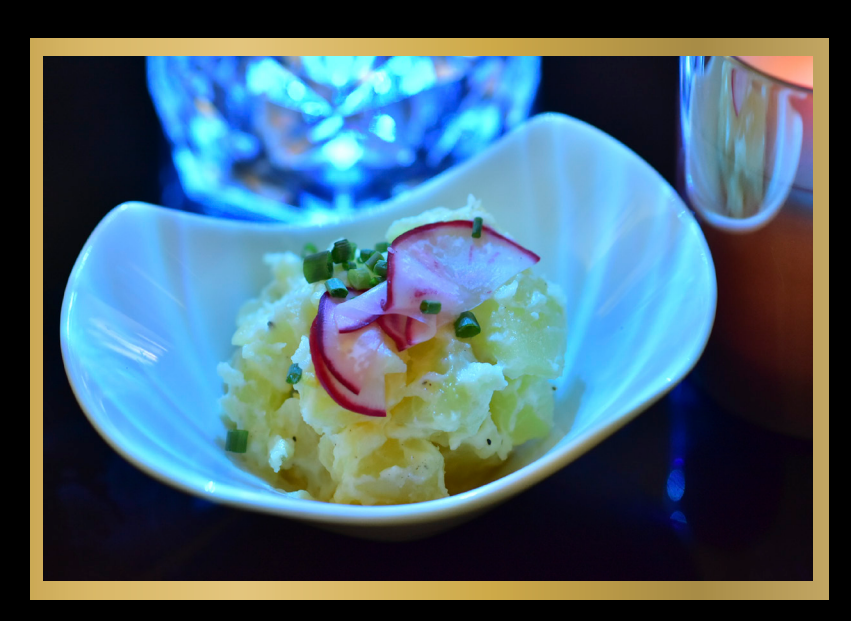
POTATO SALAD WITH PICKLED RADISH