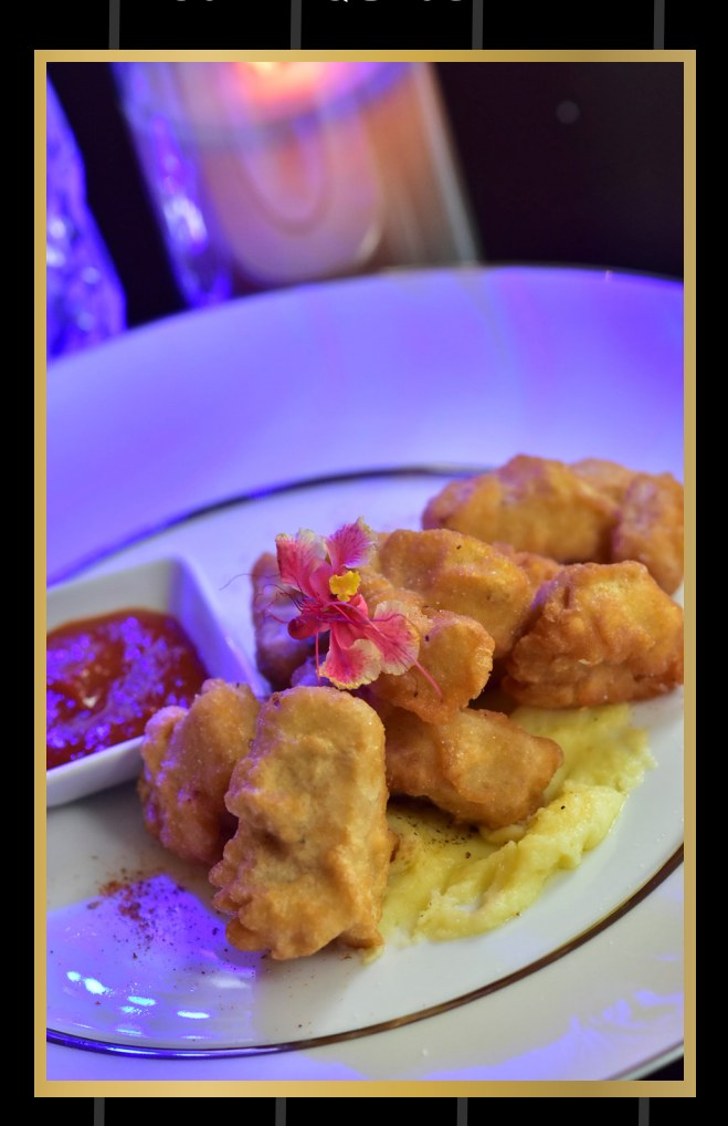
VEGAN FRIED CHICKEN

SLOW COOKED AND COATED WITH OUR BBQ SAUCE