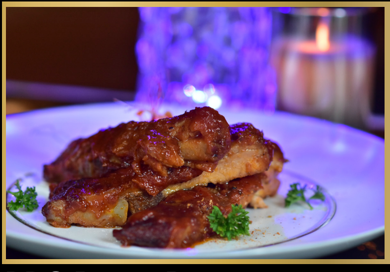
BBQ PORK RIBS

FALL OFF THE BONE TENDER AND SMOTHERED WITH TABASCO BBQ SAUCE