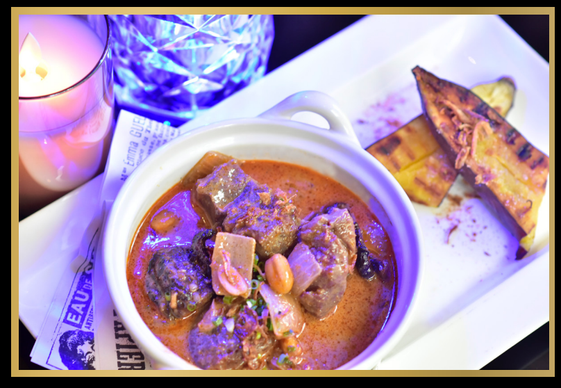
BEEF MASSAMAN WITH SWEET POTATO

FALL OFF THE BONE TENDER AND SMOTHERED WITH TABASCO BBQ SAUCE