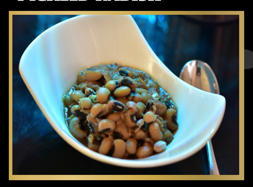
BLACK EYED PEAS (V)