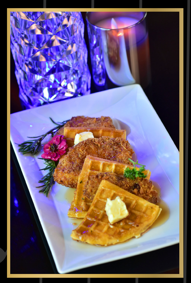
CHICKEN WAFFLE FRIED CHICKEN WITH HONEY BUTTER DRIZZLE