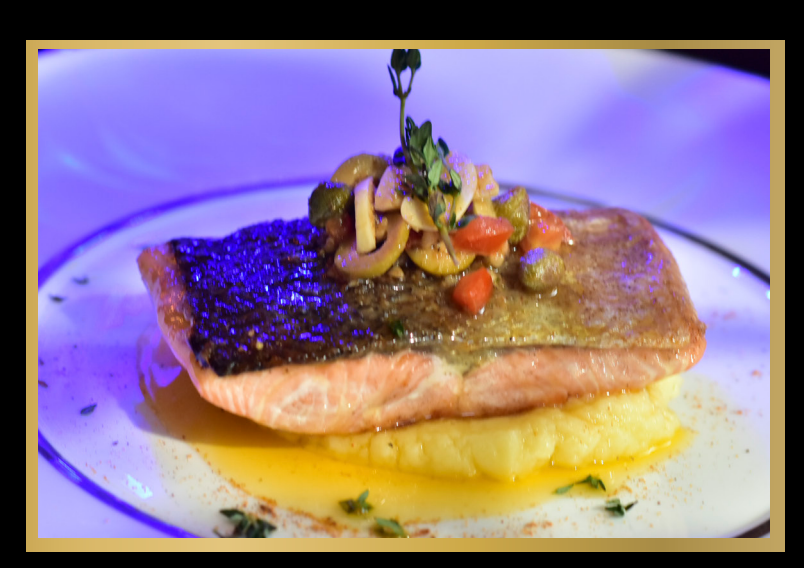
GRILLED SALMON WITH LEMON BUTTER SAUCE

TRADITIONAL SOUTHERN THAI CURRY WITH A SOULFUL TWIST