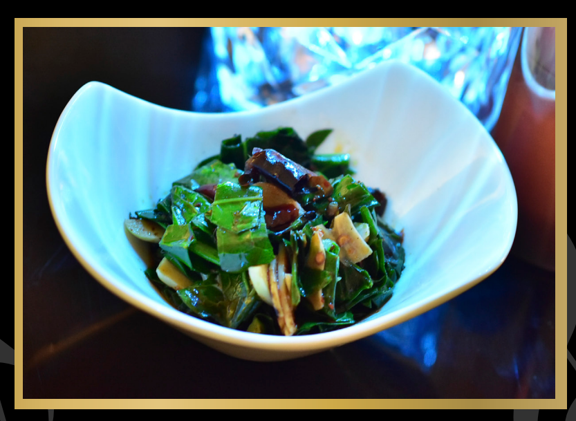
COLLARD GREENS (V) MASHED POTATO VEGAN MAC N CHEESE (V) STEAMED JASMINE RICE (V)