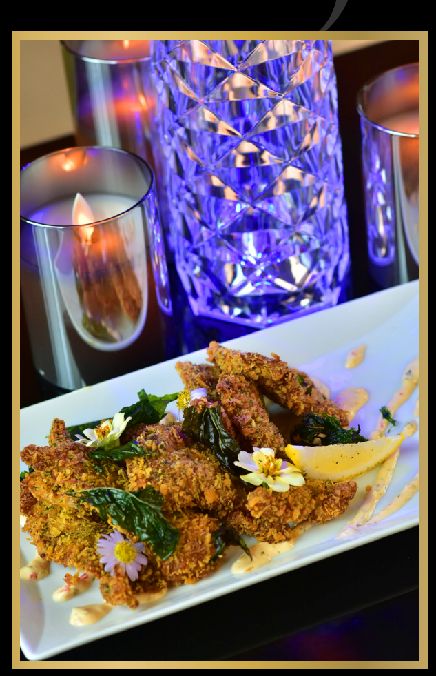
CATFISH NUGGETS FRIED CATFISH CREOLE STYLE