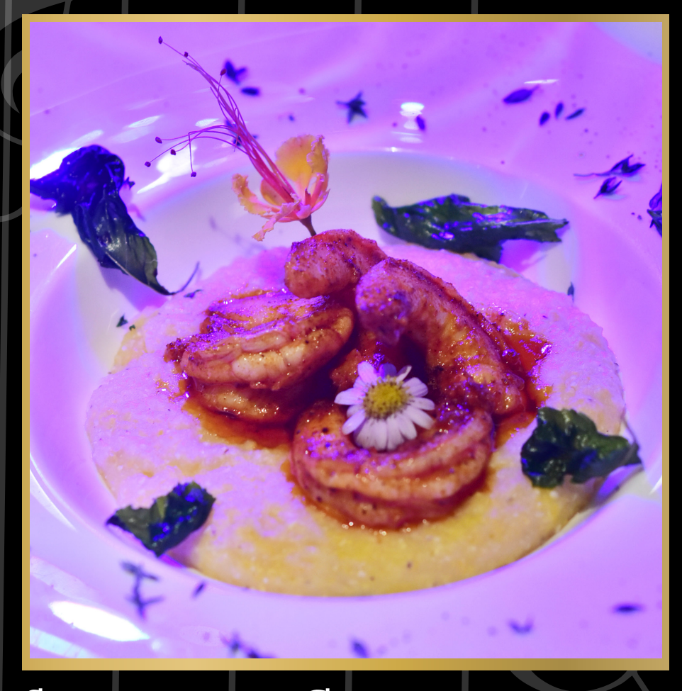
SHRIMP AND GRITS CLASSIC US SOUTHERN DISH OF CREAMY GRITS TOPPED WITH SHRIMP