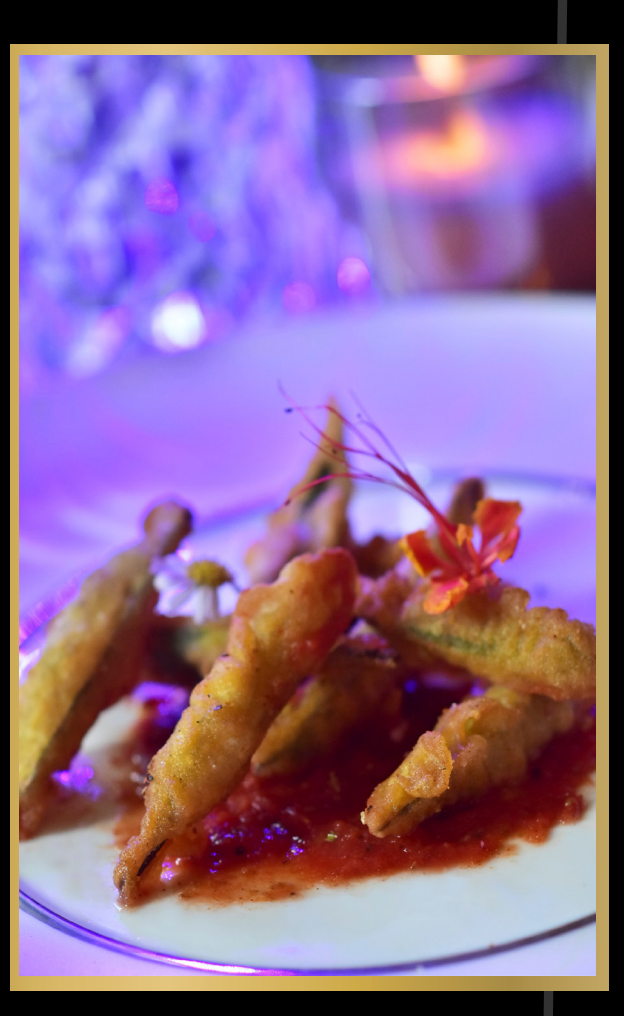
OKRA STUFFED WITH VEGAN CHEESE