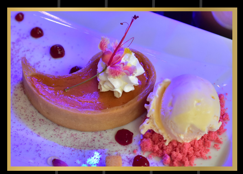
SWEET POTATO PIE VEGAN SORBET RASPBERRY OR LEMON