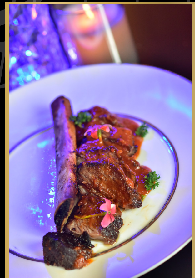
BEEF SHORT RIB WITH SPICY BBQ SAUCE

SLOW COOKED AND COATED WITH OUR BBQ SAUCE