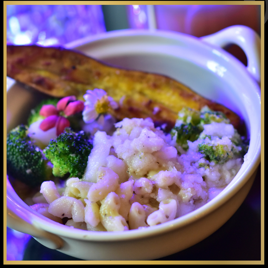
VEGAN TRIO MAC N CHEESE, BROCCOLI IN A SWEET POTATO A VEGAN FAVOURITE