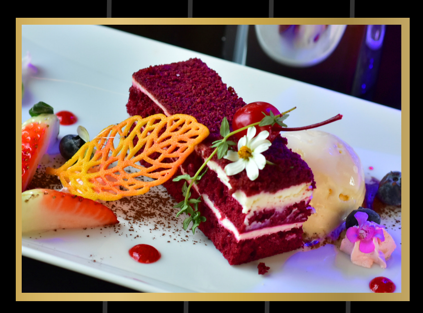
RED VELVET CAKE